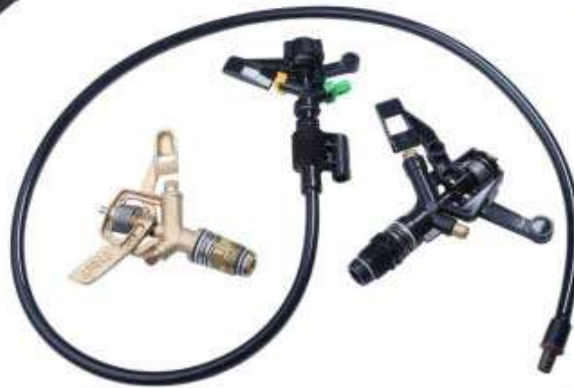
Impact Sprinkler & Mini Sprinkler