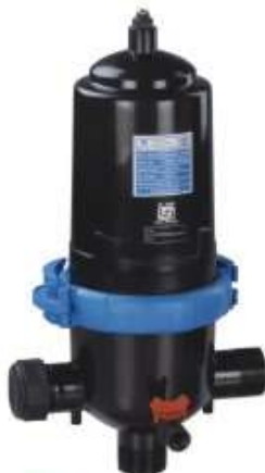
2" Super Screen & Disc Filter