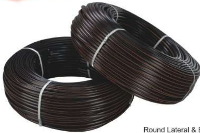
Round Lateral & Emitting Pipes