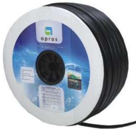
Flat Emitting Pipe