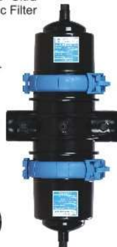
3" Ultra Screen & Disc Filter