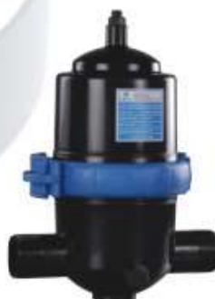
2" Ultra Screen & Disc Filter